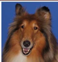
Reveille IX First Lady of Texas A&M